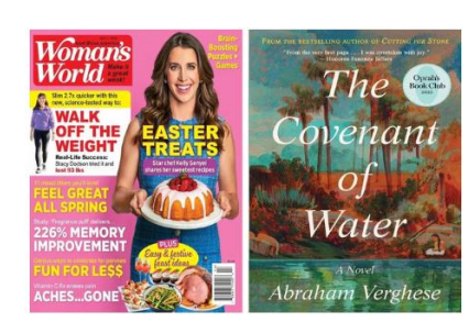
Top titles checked out by Hector patrons from the Libby app

In 2024, the E. B. Pert Reading Center is working to secure sustainable funding that will allow the Reading Center to continue operating for years to come. Securing sustainable funding will ensure that the Reading Center can continue to cover costs for fees paid to STLS; wages for a paid director; utilities; unique programs for adults and children; improved technology, including public computers and wireless services; downloadable books; copy services; and more. The Board of Directors of both the E. B. Pert Reading Center and the Watkins Glen Public Library are working together to support this endeavor, and in May, residents of the Watkins Glen School District will have the opportunity to vote for funding for both libraries.